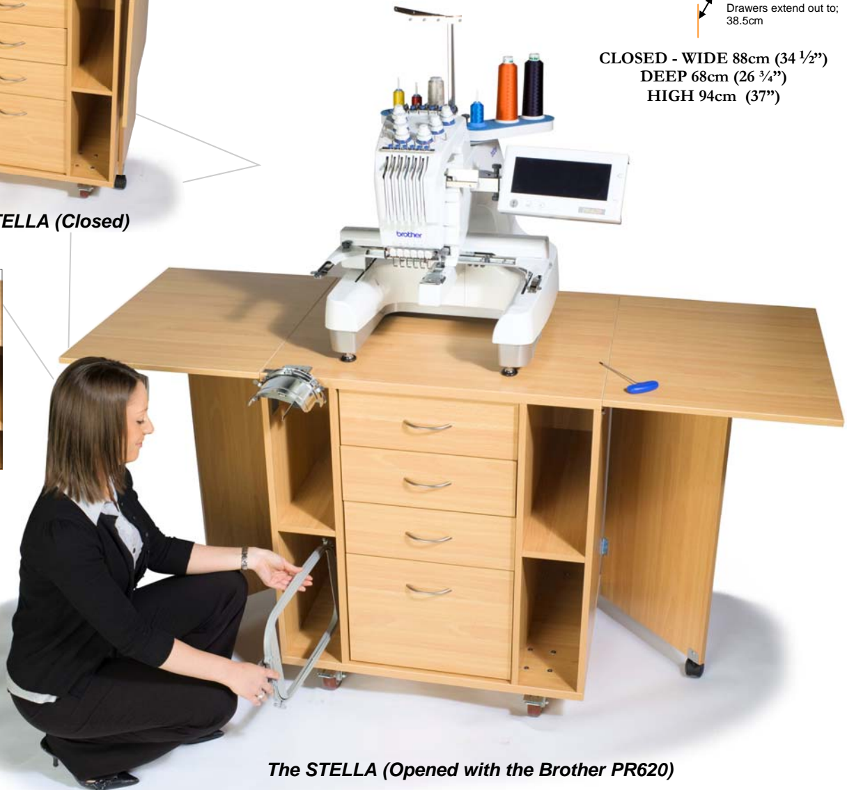
The STELLA (Opened with the Brother PR620)