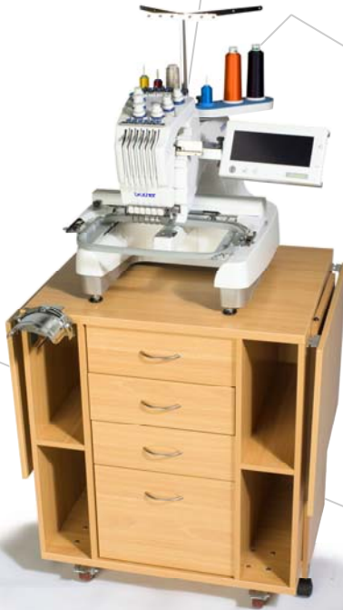
The STELLA (Closed)

CLOSED - WIDE 88cm (34 1/2") DEEP 68cm (26 3/4") HIGH 94cm (37")