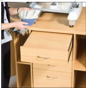
A cleverly hidden hooping platform