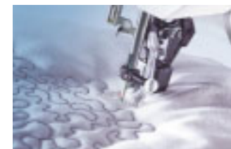
Free-motion sewing position Use the special free-motion sewing position for the presser foot to get the highest clearance for your free-motion quilting and stippling. It makes free-motion quilting so easy!