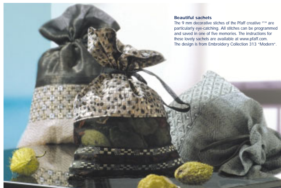
Beautiful sachets The 9 mm decorative stitches of the Pfaff creative 2134 are particularly eye-catching. All stitches can be programmed and saved in one of five memories. The instructions for these lovely sachets are available at www.pfaff.com . The design is from Embroidery Collection 313 "Modern".