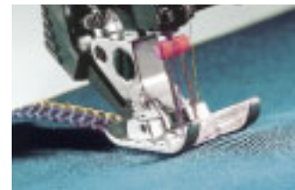
The twin needle program The window always shows when a twin needle can be used for a stitch. When sewing with two threads, use the included extra spool pin.