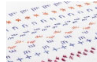
Exclusive from Pfaff! Unique antique quilt stitches – admired by quilting experts around the world. The quilt seam becomes a decorative detail, opening up new areas of creativity.

The Pfaff creative 2134 has all the extra features that make quilting a real pleasure, like the original IDT™ for even fabric feed, the special free-motion sewing position, and the unique antique quilt stitches for delightful details... and all only from Pfaff.