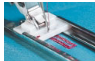
Only from Pfaff! The secret of perfect buttonholes is the unique Sensor-automatic Buttonhole, exclusively from Pfaff. It "feels" each fabric. The result is consistent, even buttonholes every time. It's the ultimate sewing convenience!