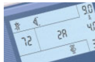
See information and optimal settings for each stitch! The illuminated window shows you the preset settings for stitch width, stitch length and thread tension. These settings can be adjusted if needed. It also shows your personal settings for the sewing functions: tie-off, needle up/down, sew slow, mirroring, single stitch and more!