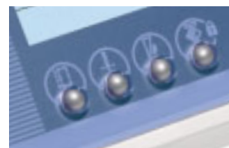
Ease of use! With the touch of a button you can: • automatically tie off the beginning and/or end of a seam, • leave the needle in the fabric while turning, • reduce speed when sewing gets difficult, • mirror your stitch, and • lock the Direct Selection buttons.