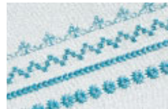
Choose from 100 stitches The Pfaff creative 2134 offers a variety of 9 mm wide stitches, decorative and utility stitches, cross stitches and hem stitches plus a built-in alphabet with 50 letters, numbers and symbols.