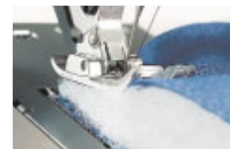
Extra high presser foot clearance! High presser foot clearance makes room for heavy fabrics or several layers of fabric!