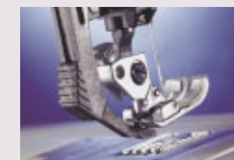
Only Pfaff gives you perfect fabric feed with the original IDT™! Pfaff makes the difference!

Absolutely even fabric feed from both the top and the bottom.