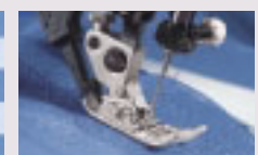
Fine fabrics, several layers – absolutely no slipping! Perfect for quilting!