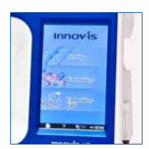
Extra-large colour touch screen

Super-smooth feeding for superior stitch quality