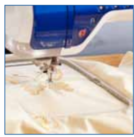
Large embroidery area 300mm x 180mm

Create large embroidery designs with no need to re-hoop