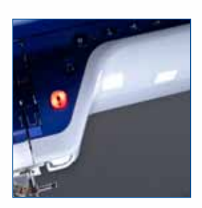
Ultra bright feature lighting

The ultra bright LED lighting gives a crisp bright natural light, so you can see colours and stitch details, no matter what your lighting conditions. The lighting brightness is fully adjustable so you can set it at a level to suit you and your environment.