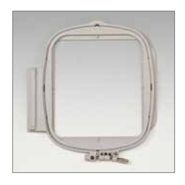
150mm x 150mm quilting frame

This 2-pin spool stand holds two large thread cones and attaches securely to your machine for thread delivery or twin needle sewing.