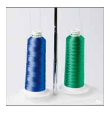
2-pin spool stand

Brother's range of embroidery design software offers features to suit all, from beginner to advanced users.