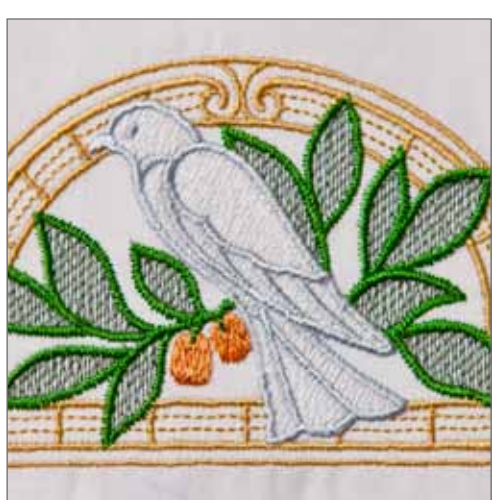
Special technique designs

Create authentic, eye-catching classic Japanese calligraphy effects with our unique patterns.