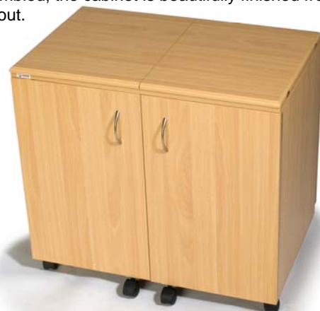
The OUTBACK closed in Beech