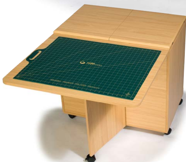
When the back work area's up, its ideal for working on.