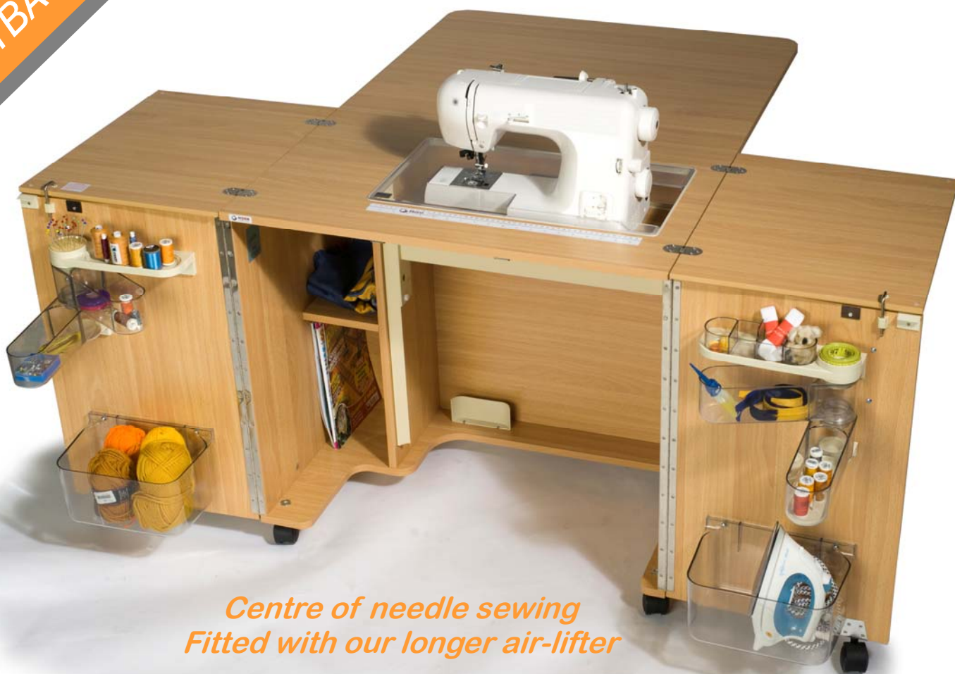
Centre of needle sewing Fitted with our longer air-lifter